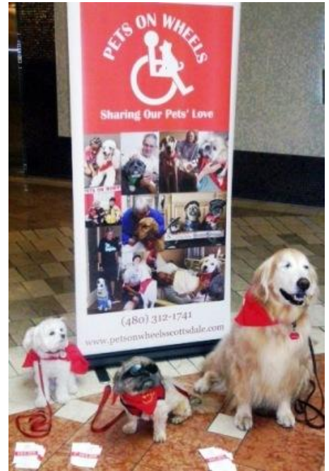
Shoppers couldn't resist purchasing coupons from Zoe, Winston, and Ella